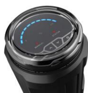
M1 Modulating Controller